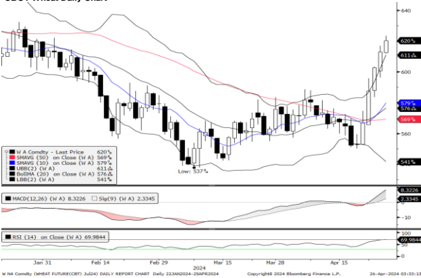
CBOT Wheat Daily Chart