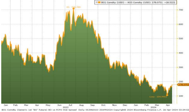
Normalised Soybean Oil vs Crude Palm Oil Spread in U.S. Dollar Metric Tonne