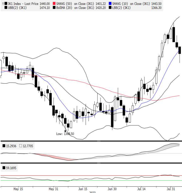
IKI Index (Generic Ist "IKI" Future) DAILY REPORT CHART Daily 09H45V2023-03AUG2023 03-Aug-2023 18:08:30