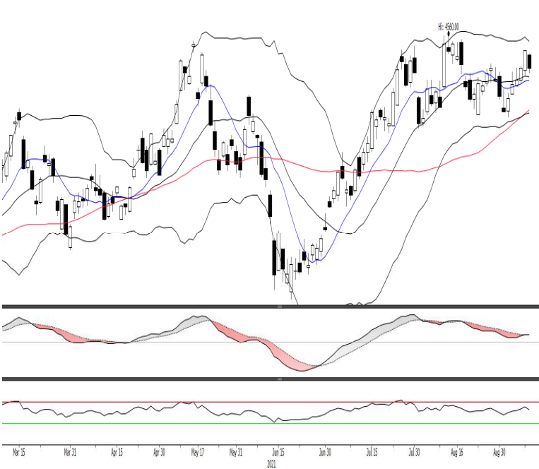
CPO Futures 3rd month daily chart